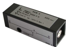
REM Standard resistors