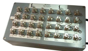
BEM28 Calibration box

Specifications subject to change without notice