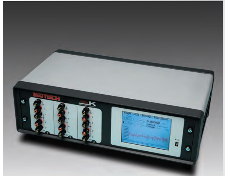
microK100 Unequaled combination of accuracy, stability and versatility.

Easy to Use: The microK includes a comprehensive range of features, including direct reading in temperature for all sensor types, data logging, easy export of data to Excel™ and graphing facilities. Despite its sophistication